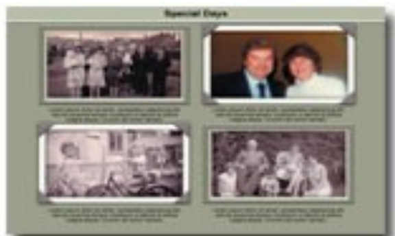
A sample page produced by Caring Memories