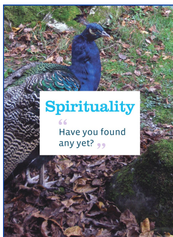
The peacock is a frequent visitor to Barlochan Care Home

This was a collaborative project between FiOP, Alzheimer's Scotland Beyond Barriers Project and Artlink Edinburgh. With the magnificent co-operation between the residents, relatives and staff at Barlochan Care Home in Dumfriesshire we talked and filmed them discussing their lives; their understanding of spiritual care and their reservations about how to discuss these issues which are so personal.