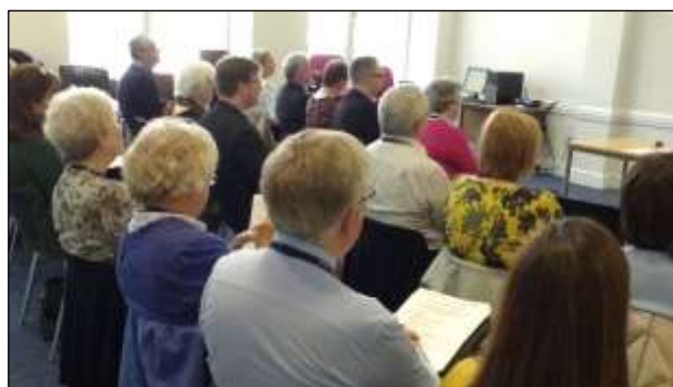
Delegates at the 'Loneliness and Isolation' meeting