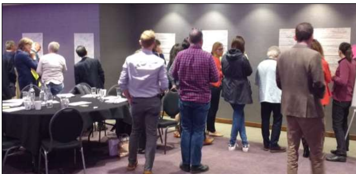
Delegates review comments from their 'round-table discussions'